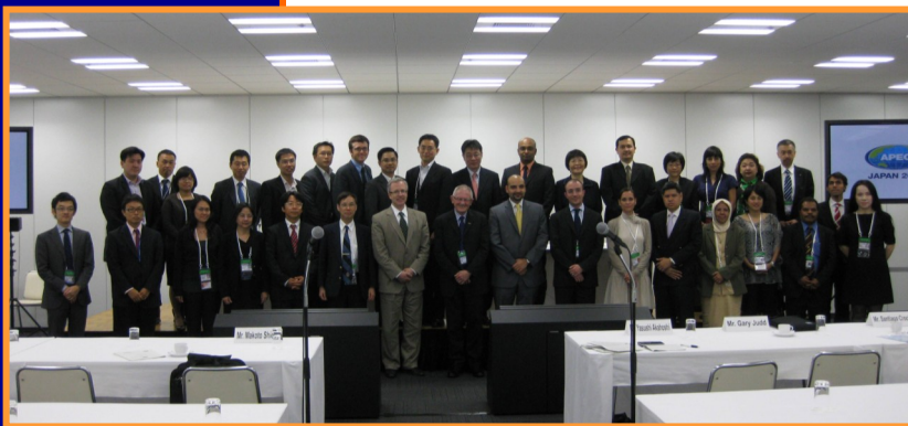
APEC Meeting, Sendai, Japan